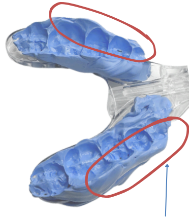
Bite material covering buccal