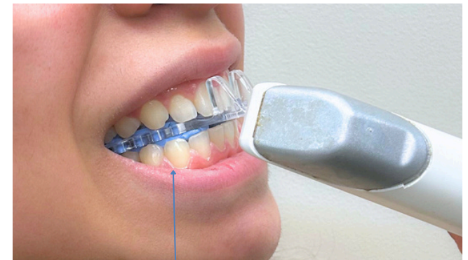
Buccal of anterior teeth visible for scanner to register bite automatically

2. Snap handle off the gauge as it may get in the way of scanning