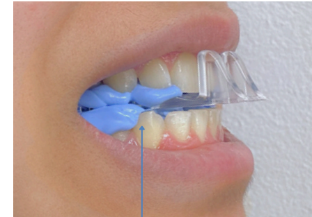
Bite material covering buccal