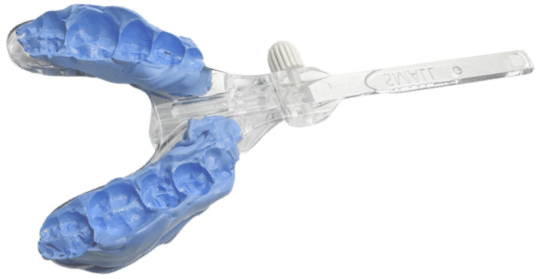
Bite registration for MAS